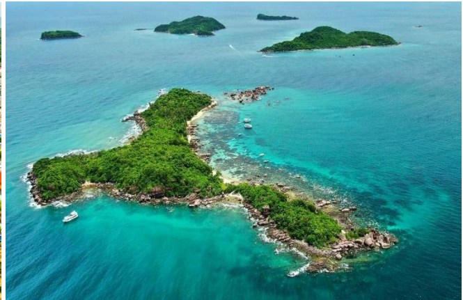
Gham Ghi Isle

And then transfer by boat to Sun World Pineapple Island Nature Park . You will have experience visit Aquatopia Water Park & Nature Park , enjoy buffet lunch , relax on the beach. Back to cable car to visit Dia Trung Hai Area and Kiss Brige - Located in the Southern Phu Quoc ecosystem, in the center of Sunset Town, Kiss Bridge is a project designed in 2 years based on the terrain and soil characteristics of the land.