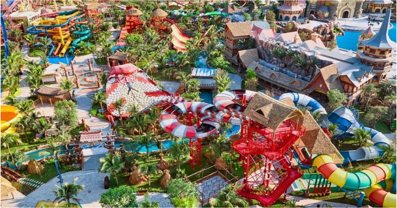
Vinwonder Theme Park